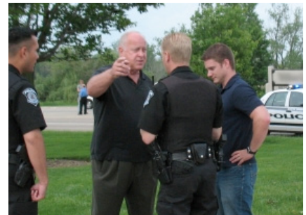
What actions must you take to avoid legal issues?

Call 9-1-1, and say “I was afraid for my life, and was forced to defend myself. Please send an ambulance right away”, then wait for the police to arrive. Try to remain as calm as possible. If the assailant is no longer a threat, then you may wish to take cover and holster the weapon. The police will arrive as quickly as possible, usually just a few minutes. When they arrive, say “He attacked me”, and “I’ll sign a complaint”. Point out as much evidence as you can, but tell the police “I need to talk to my lawyer and I do not consent to any search.”