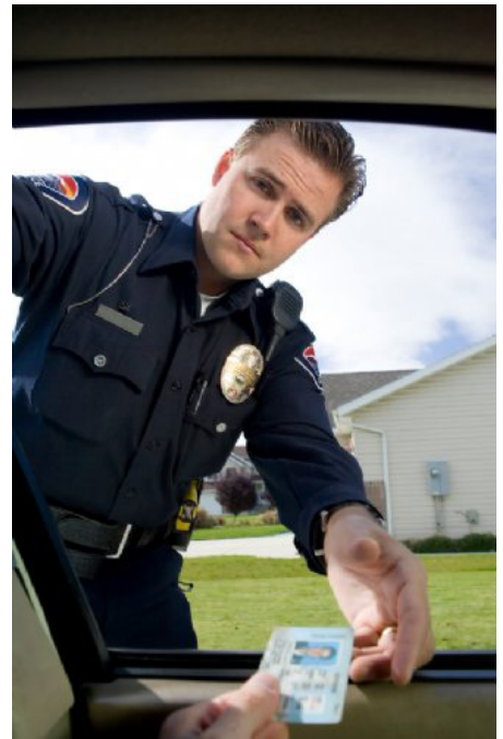
A routine traffic stop could turn into serious legal problems if you don't know your responsibilities...

Police officers are our friends, and fellow warriors. Obey their instructions at all times.