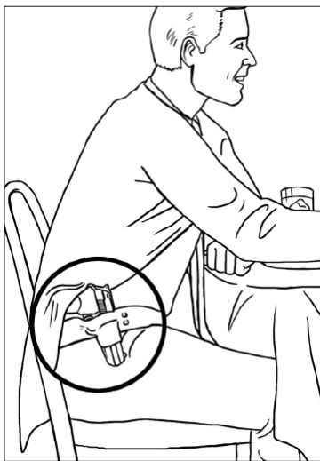
Even the best of us make mistakes... What will you do if someone sees your 'concealed' handgun?