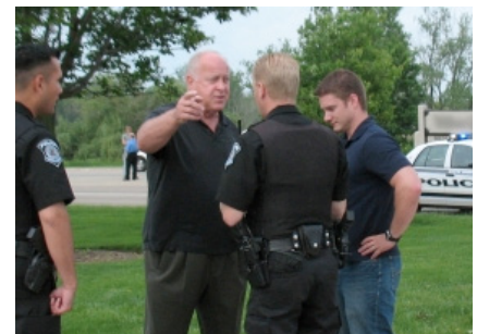
What actions must you take to avoid legal issues?

Call 9-1-1, and say “I was afraid for my life, and was forced to defend myself. Please send an ambulance right away”, then wait for the police to arrive. Try to remain as calm as possible. If the assailant is no longer a threat, then you may wish to take cover and holster the weapon. The police will arrive as quickly as possible, usually just a few minutes. When they arrive, say “He attacked me”, and “I’ll sign a complaint”. Point out as much evidence as you can, but tell the police “I need to talk to my lawyer and I do not consent to any search.”